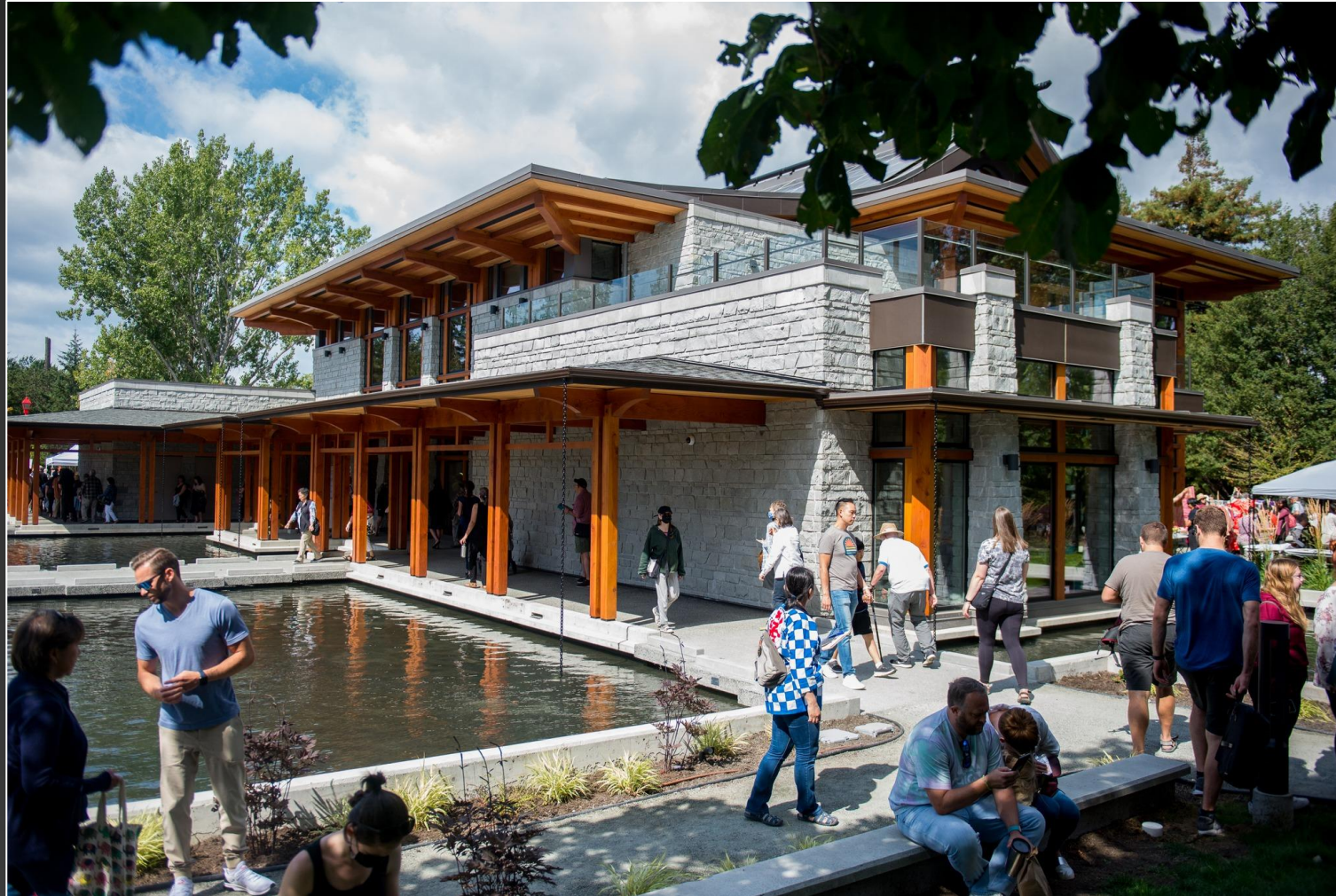
Esquimalt Gorge Park Pavilion