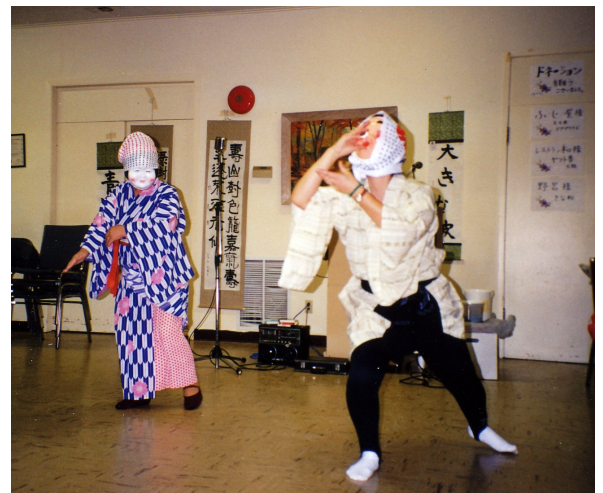
Mochi Tsuki Kai 1998