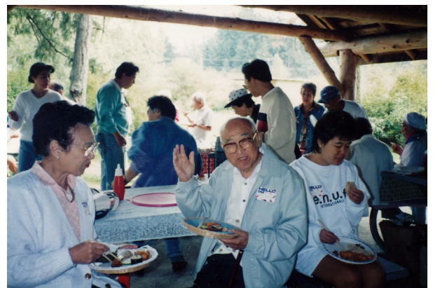
Elk Lake 1999