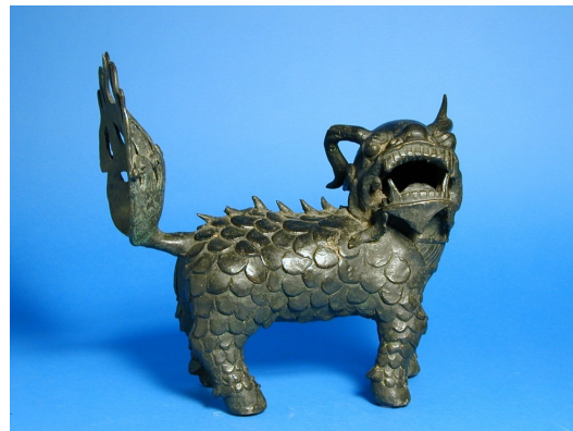
Statue of Qilin unicorn | Chinese | Bronze | Qing dynasty | Gift of Irving Zucker